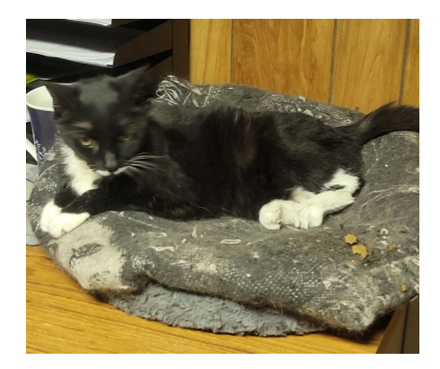
Oreo

We also enjoyed the relationship we developed with the District's resident cat, Oreo. Oreo is estimated to be 25 years old, and she seems to be a great morale builder for the District staff. Plus, she has probably been an excellent "mouser" for them.