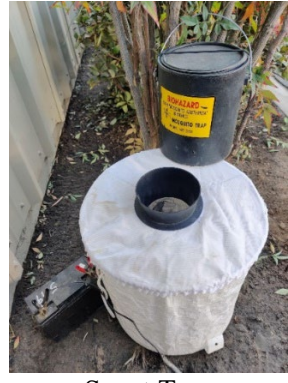
Scent Trap

T. In addition to larvicides, female breeding mosquitoes are controlled with several types of traps that are baited with CO<sub>2</sub>, artificial human scent, or stinky nutrient-rich water.